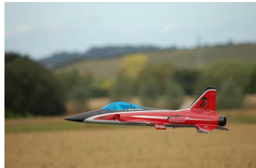
Habu electric converted with JetCat 20 turbine