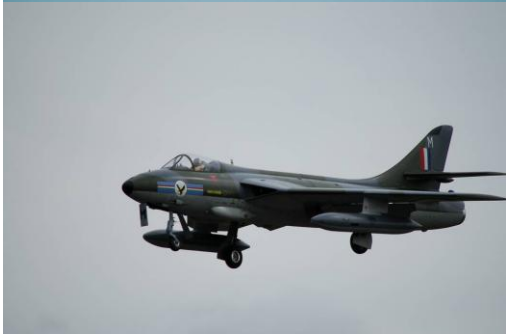
AirWorld kit with an all up cost in excess of five figures in case you fancy one!