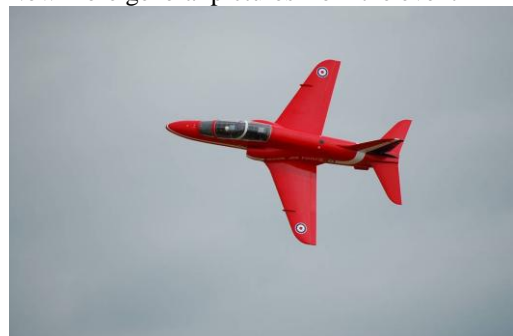
Composite ARF Hawk, picture here in memory of Jon Egging Red 4 who was tragically killed that weekend near Bournemouth

Now more general pictures from the event