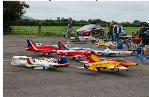
Small part of pits area

Here are a few pictures of the general event.