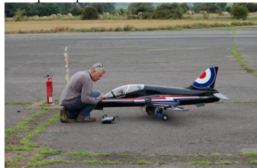
Engine start area