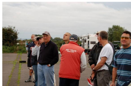
A few of the members who came to watch