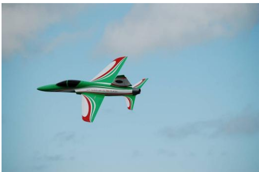
CARF Flash sport model