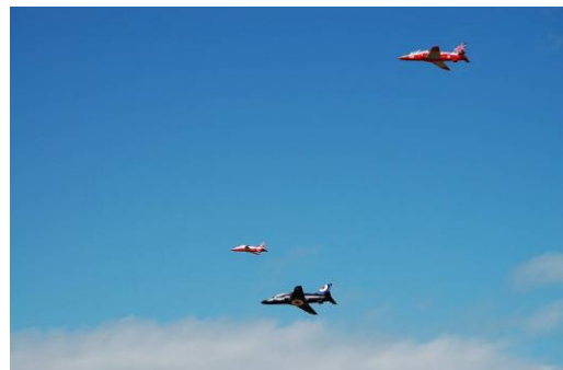
CARF Hawks in formation, well nearly